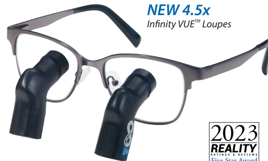
NEW 4.5x Infinity VUE™ Loupes