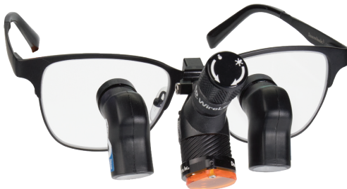
Infinity VUE™ 3.5x shown with LED DayLite® WireLess Mini HDi