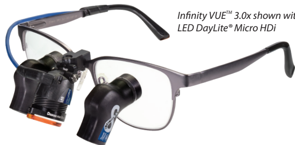
Infinity VUE™ 3.0x shown with LED DayLite® Micro HDi